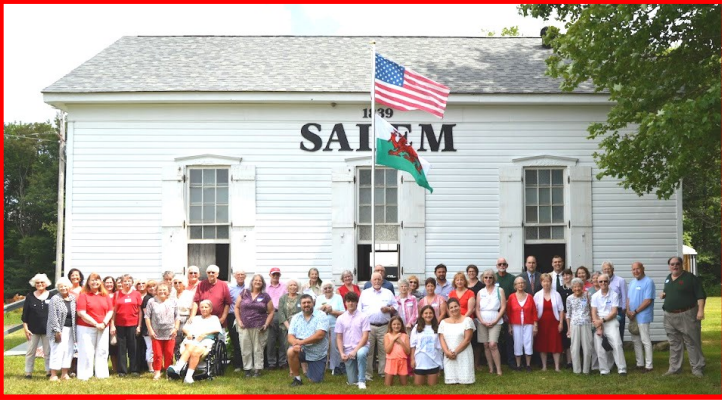
It was a great turnout for the 100(++) anniversary Salem Homecoming in August 2022!

Also back on in 2022 was the Owain Glyndwr Pub Crawl. Thanks to all who joined us in honor of the last native Prince of Wales.