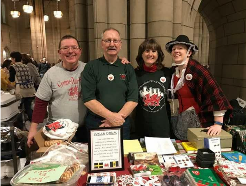
Volunteers at the Nationality Rooms Holiday Open House in Dec. 2017