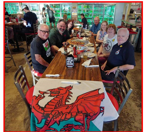
The June Dinner Gathering went north to the House of 1000 Beers in Warrendale. Rumor has it that at least of few of those beers were left for other patrons.