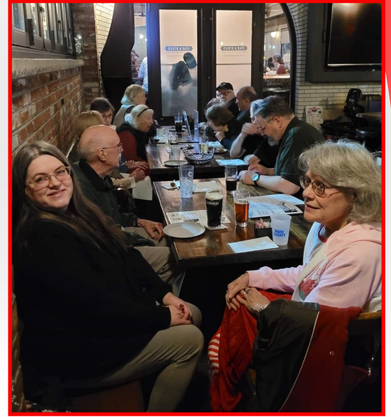
The Wales Week Dinner Gathering at Duke's Upper Deck in Homestead was well attended by friends old and new.