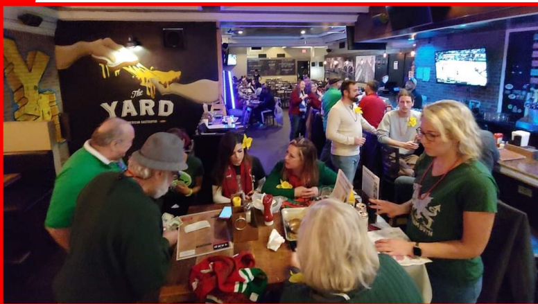
The downtown pub crawl takes over The Yard—and their jukebox!