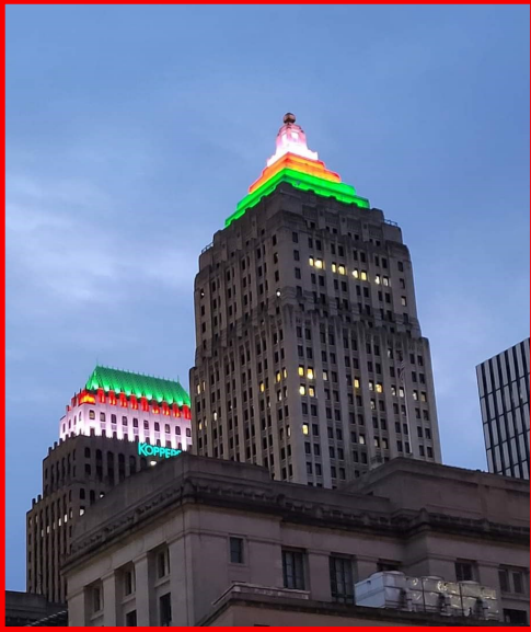
Gulf Tower and Koppers Building once again light up their beacons in the colors of the Welsh flag on St. David's Day.