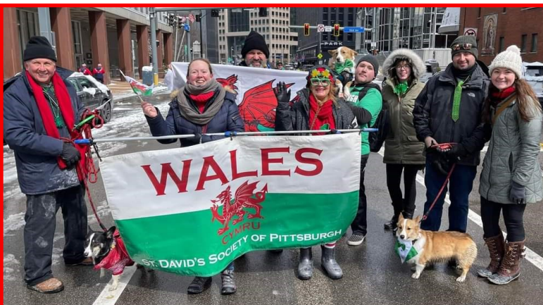
Big thanks to our friends the Pittsburgh Corgi Gathering for joining us for a snowy St. Patrick's Day Parade.